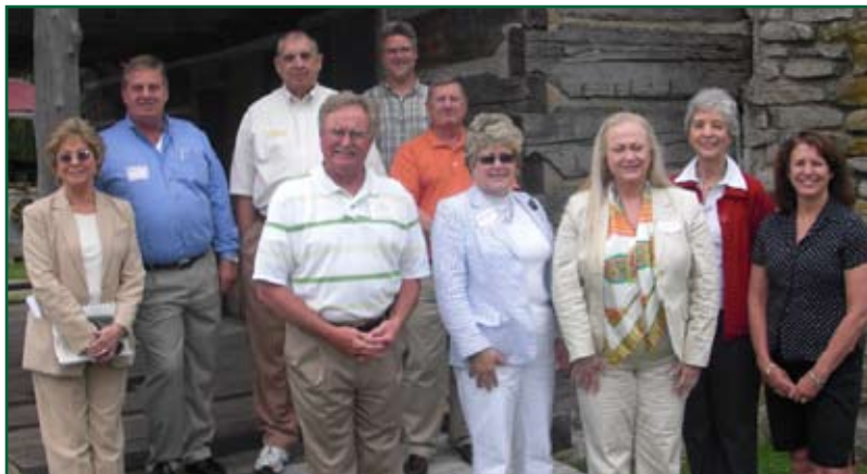
Cumberland County representatives visit one of the local attractions in Robertson County.

Cumberland County representatives traveled to Robertson County on May 28th & 29th. Robertson County representatives visited Cumberland County on June 18th & 19th.