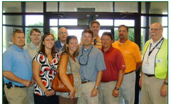
Robertson County representatives tour CoLinX while visiting Cumberland County.