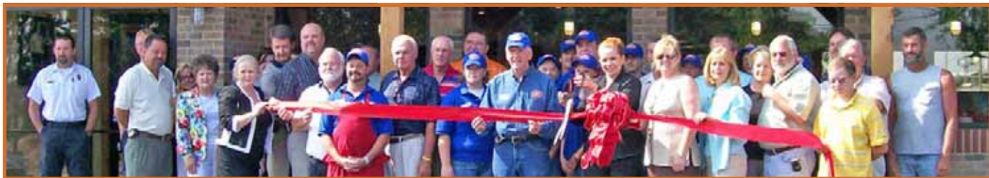
DICKEY'S BARBECUE PIT

Various prizes were given away throughout the evening. Guest enjoyed an array of d'oeuvres and beverages while becoming better acquainted with other members of the Chamber. Frontier Communications will donate all proceeds from the Women's Open Championship to the Cumberland County Rescue Squad. A special thanks to everyone who donated the prizes as well as Frontier for their sponsorship of the event. And as always, a special thank you to Budweiser for their assistance.