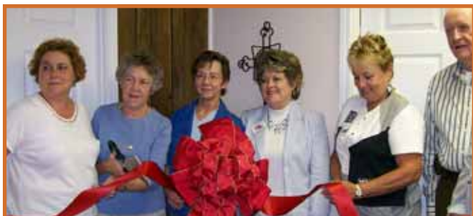
CHRISTIAN COUNSELING CENTER of Cumberland County