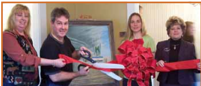
THE STARVING ARTIST GALLERY