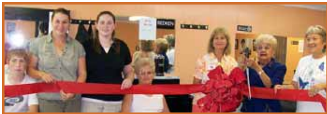
THE HAIR HOUSE